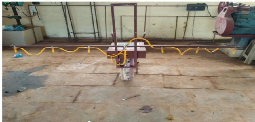
Fig.2 Solar operated trolley type sprayer