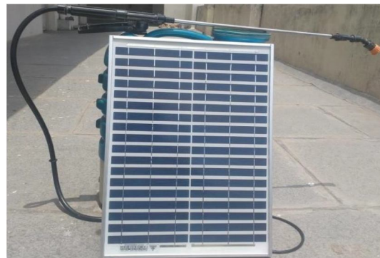
Fig.3 Fabricated solar pesticide sprayer (back sprayer)