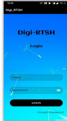
Figure 6: Application Login Page