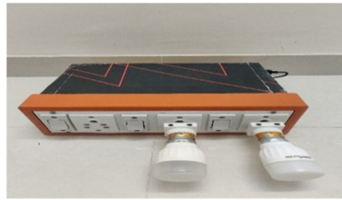
Figure 4: Outside View of the System