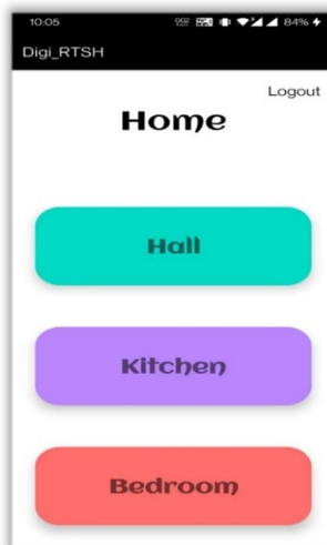
Figure 7: Application Home Page