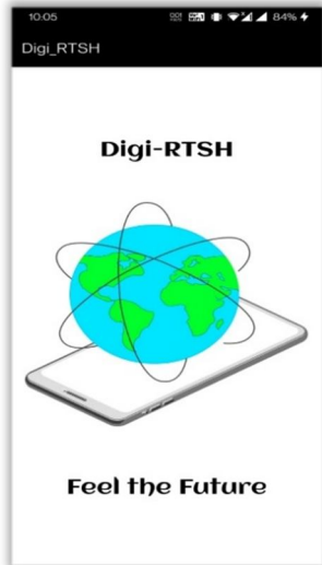
Figure 5: Application Splash Screen Page