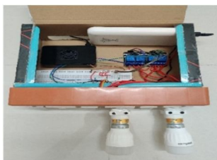
Figure 3: Inside View of the System