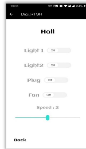
Figure 8: Application Room Page