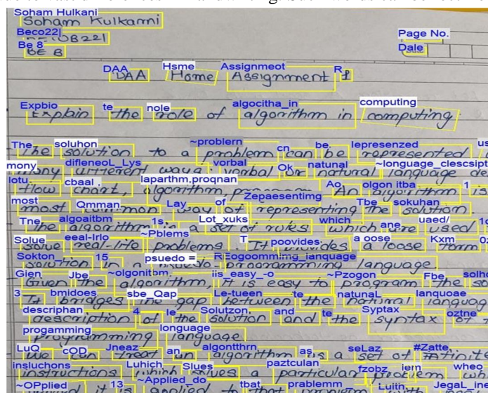
Fig 3. Example of OCR