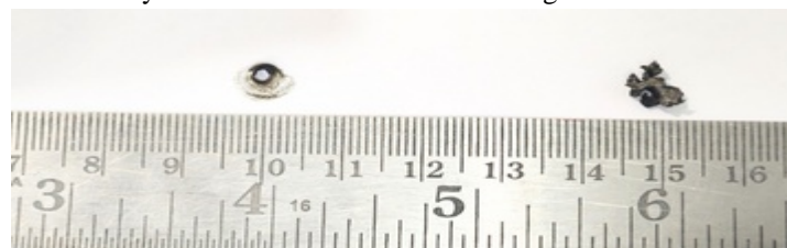
Regular Ammunition p-cap & Country Made Ammunition p-cap

Test firing of Country-made ammunition was conducted through a pistol/firearm capable of chambering the 7.65mm cartridge. Post-firing analysis revealed that the percussion cap often failed to remain intact, unlike the consistent condition observed in regular factory ammunition. In several cases, the percussion cap appeared distorted in its structure, as illustrated in the figure 4, further indicating the inferior quality used in country-made ammunition manufacturing.