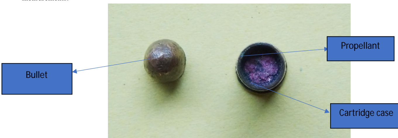
(Country Made Ammunition)

Regular ammunition demonstrates dimensional uniformity, while country-made ammunition exhibits irregular and inconsistent measurements.