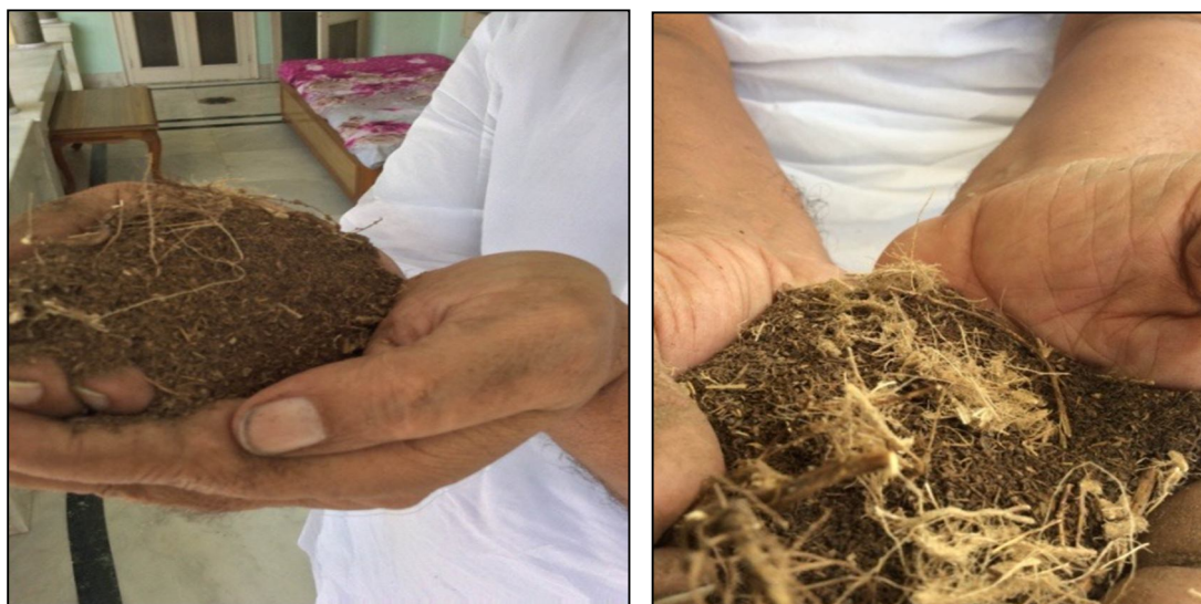
Fig. 1: Mycorrhizal Granular prepared in field. Sample holding by Dr.Ram Bajaj