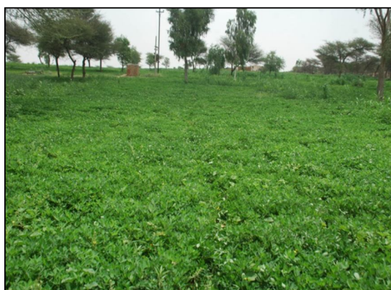
Fig. 2: Photo shows the actual healthier groundnut standing crops at field