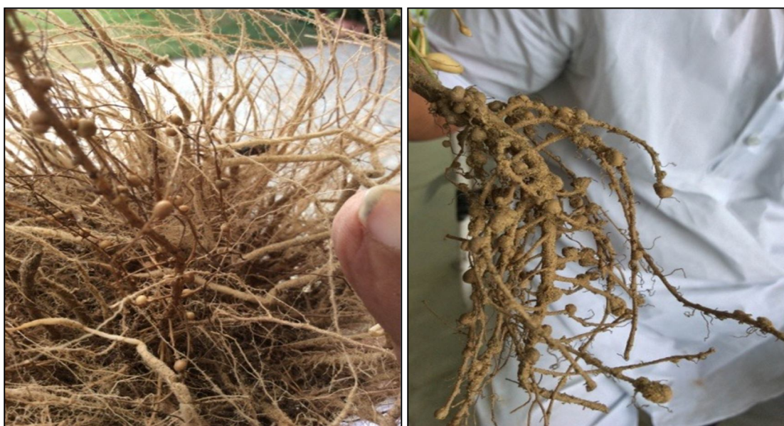
Fig. 4: Arbuscules are found inside root & arbuscular mycorrhizae inoculum contains spores & colonized root fragments