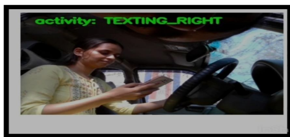
Fig 3: Activity Texting Right

The above figure represents the system which detects that the driver is texting right