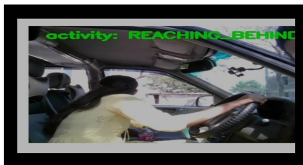
Fig 4: Activity Reaching Behind

The above figure represents the system which detects that the driver is texting right