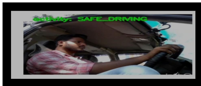
Fig 5: Activity Safe Driving

The above figure represents the system which detects that the driver is safely driving