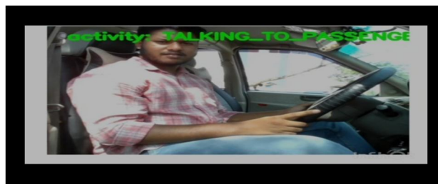
Fig 4: Activity Talking to Passenger

The above figure represents the system which detects that the driver is reaching behind