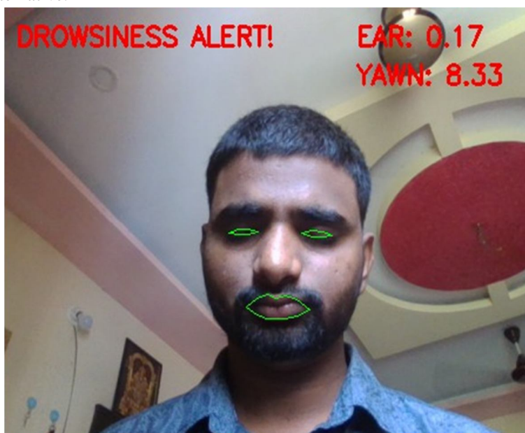
Fig 4.1 Result of Drowsiness Alert

This section presents the results derived from the experimental evaluation. These results were obtained by following the experimentation methodology described in Section 3.3 with each of the two solutions proposed in this work, so there is a subsection for the performance of each alternative.