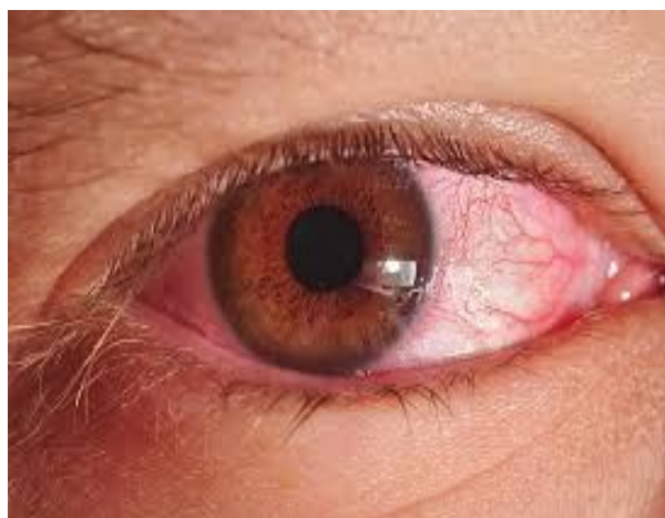
FIG 4.2 DRUGGED SAMPLE 2