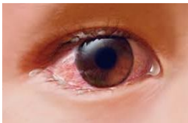
FIG 4.3 DRUGGED SAMPLE 3