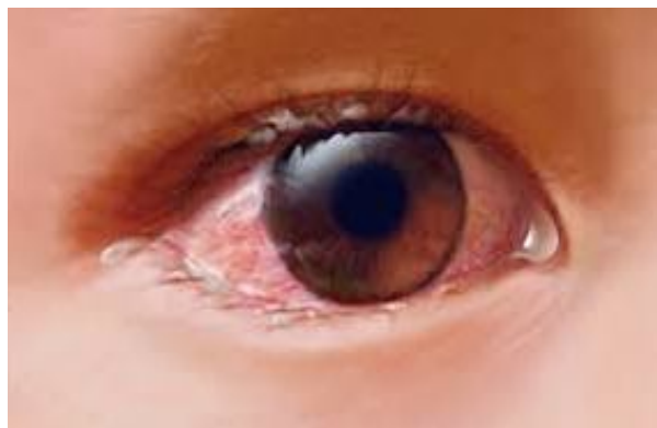
FIG 4.3 DRUGGED SAMPLE 3