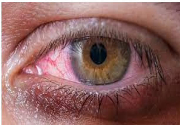
FIG 4.1 DRUGGED SAMPLE 1