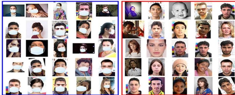
Fig.6: Face Dataset With and Without Masks

The facial features or facial landmarks are detected from the closure face cropped image from the dataset.