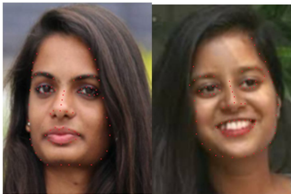
Fig.5: Detecting Facial Features

The facial features or facial landmarks are detected from the closure face cropped image from the dataset.