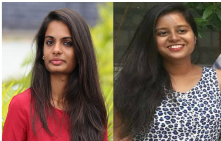
Fig. 2: Faces Detected

For the usage of facial features or landmarks to build datasets wearing masks, first an image of the face without mask is to be considered.