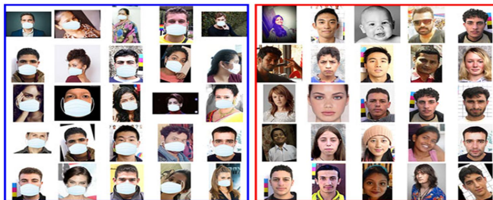
Fig.6: Face Dataset With and Without Masks

The facial features or facial landmarks are detected from the closure face cropped image from the dataset.