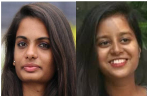
Fig.4: Face Closure

Then the apply the face detection classifier to compute the bounding box of the face location that means the classifier has detected the face from the given image.