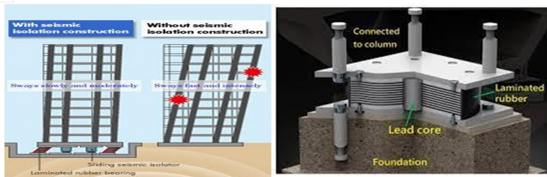
Fig.1 Isolation system and Lead rubber bearing