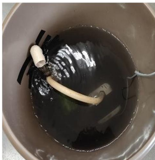
Fig:- 1.2 Contaminated Water (Before filtration)