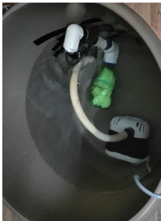
Fig 1.3 :- Filtered Water (After Filtration)