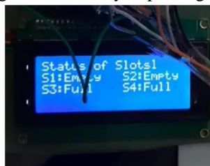
Fig3. LCD Slot status output.

The parking system's performance was evaluated based on its ability to accurately detect the occupancy status of each parking slot, update the count of available slots, and control the gate operations accordingly. Additionally, the functionality of the LCD display in conveying real-time information to drivers regarding the availability of parking spaces was assessed.