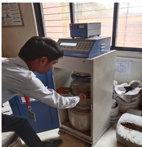
Fig : - DCTM