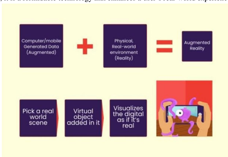
Fig : Relationship between the Real world and Virtual world.

Augmented Reality(AR) is only heretofore a fiction. It has risen to become a fresh challenge for many researchers, scientists and technologists around the globe and has helped change the way users interact with the world sensationally. With the spiking rate of new smartphones, Augmented Reality is moving forward to bring creativity to life and help users interact with the organisations at a deeper level. Simply put, it is a formidable technology that enhances a user's real-world experience.