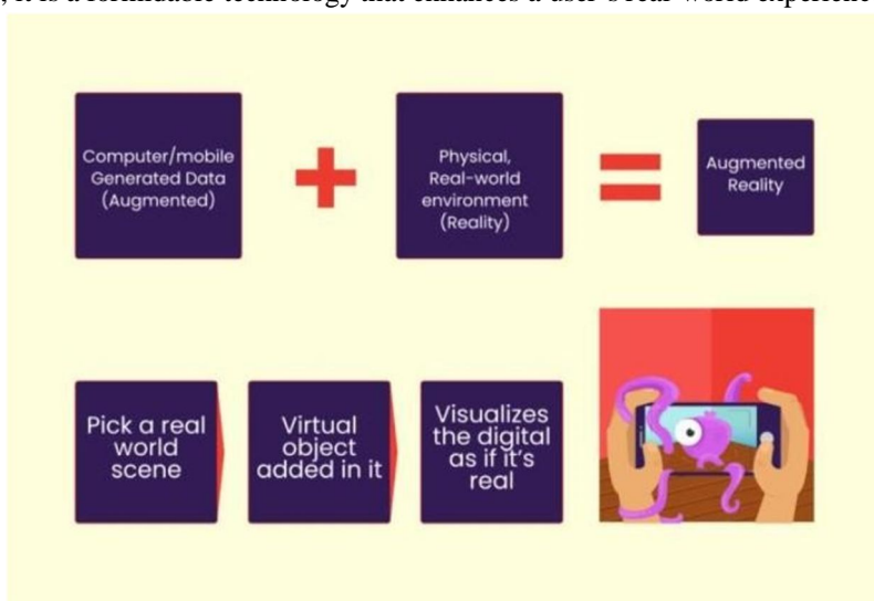
Fig : Relationship between the Real world and Virtual world.

Augmented Reality(AR) is only heretofore a fiction. It has risen to become a fresh challenge for many researchers, scientists and technologists around the globe and has helped change the way users interact with the world sensationally. With the spiking rate of new smartphones, Augmented Reality is moving forward to bring creativity to life and help users interact with the organisations at a deeper level. Simply put, it is a formidable technology that enhances a user's real-world experience.