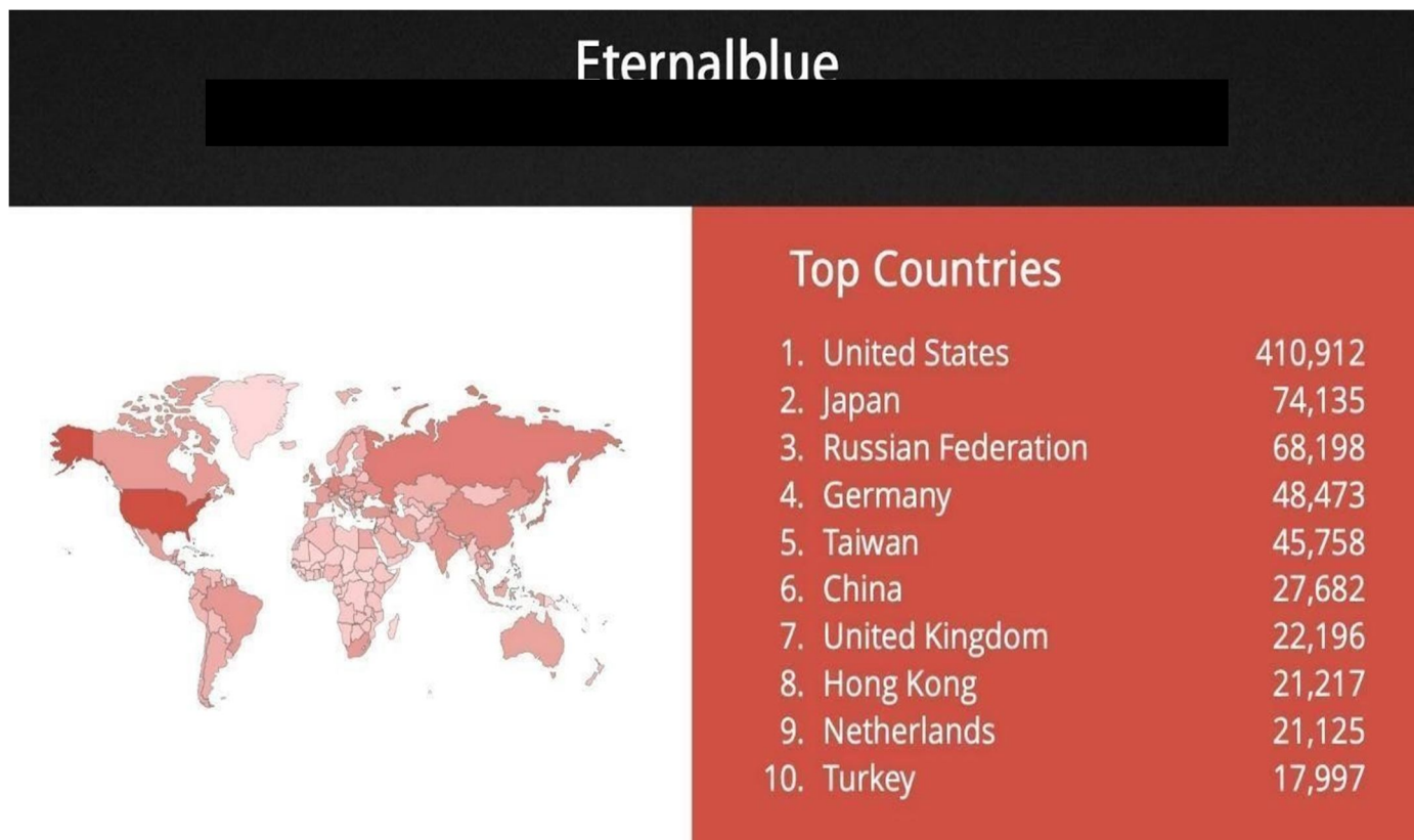
Fig. 1 Research Work