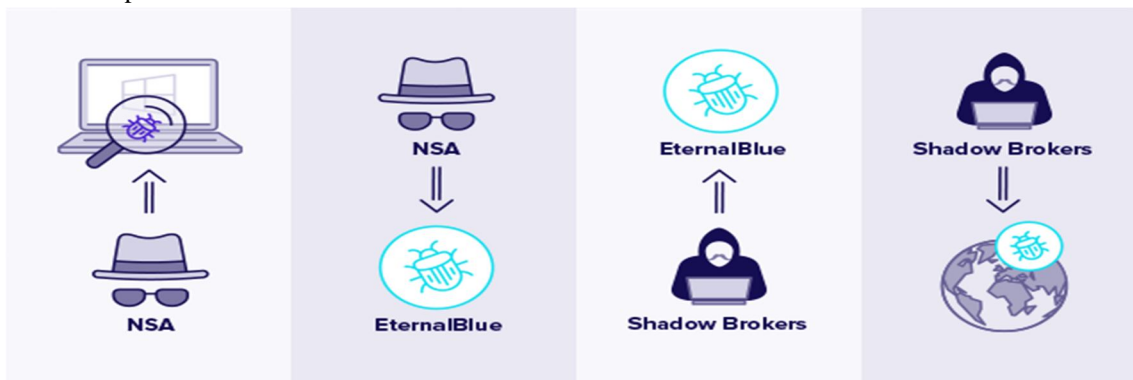
Fig. 5 Result

Security researchers analyzed Eternal Blue's vulnerabilities to understand their root causes and identify potential areas for improvement in Windows operating system development. This review has led to the development of more secure systems and designs that are less susceptible to similar vulnerabilities.