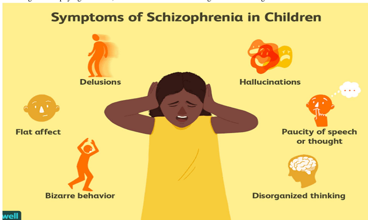
Fig-2-Sign And Symptoms in Children

Along with having trouble paying attention, it can be hard for them to organize their thoughts and make decisions.