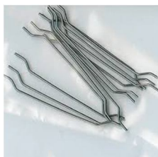
Fig.6. Steel fibers (hooked end)

Aspect ratios in the range of 40–80 are currently in use; fibres are typically spread uniformly across a particular cross section, while reinforcing bars or wires are added only when necessary. Unlike continuous reinforcing bars or wires, steel fibres are both short and densely packed. When compared to a network of reinforcing bars or wires, steel fibres cannot usually provide the same ratio of reinforcement area to concrete area. As little as 1% by volume of steel fibres added to concrete has been demonstrated to significantly reduce plastic shrinkage cracking. Although steel fibres do not normally affect free shrinkage of concrete, they have been shown to increase resistance to cracking and decrease fracture width at high enough dosages (Shah, Weiss, and Yang, 1998).