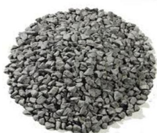
Fig.2. Coarse aggregate