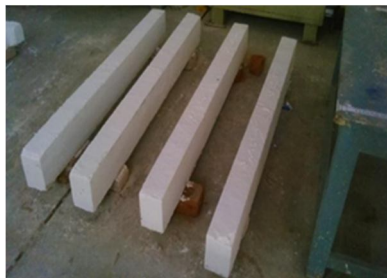
Fig.7. Prepared Beam

The beam estimate has been used to guide the installation of the wooden formworks and the tying up of the necessary reinforcement. To prevent formwork from coming into touch with reinforcement, coverings are being provided. The beam estimate has been used to guide the installation of the wooden formworks and the tying up of the necessary reinforcement. To prevent formwork from coming into touch with reinforcement, coverings are being provided. Below is a diagram detailing the formwork and reinforcement that was provided.