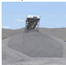
Fig.3. Fine aggregate

Together with coarse aggregates, fine aggregate plays a pivotal role in concrete and other construction materials. The standard definition of fine aggregates is any material that can be sieved using a 4.75 mm (0.187 in) mesh size sieve. They are crucial to the improvement of concrete's workability, strength, and durability.