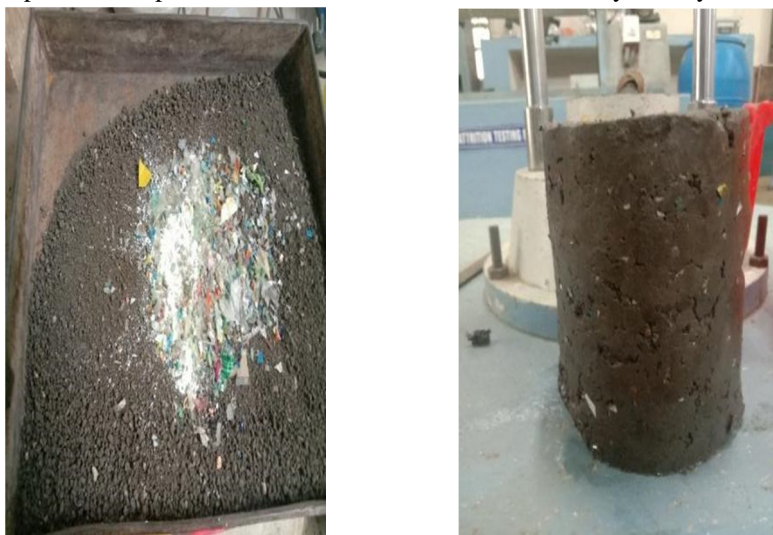
Fig 1 : Standard Proctor Compaction Test

The Standard Proctor Compaction Test is used to find the optimum moisture content at which the soil reaches its maximum dry density and becomes dense. Standard proctor Compaction Test were done by adding different proportions of plastic and expired medicines. The optimum water content and maximum dry density were noted for different proportions and the results are tabulated. From the results the graphs are plotted for optimum moisture content and maximum dry density.