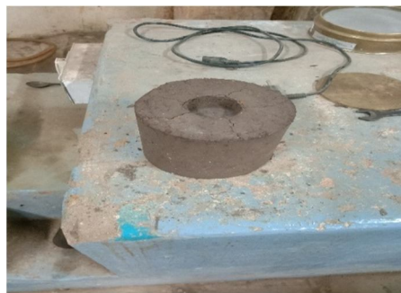
Fig 3 : California Bearing Ratio Test