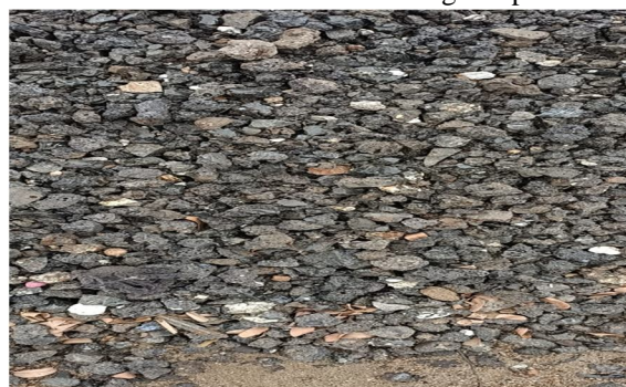
Fig:2 steel slag sample.

5) Steel Slag : Steel slag is an industrial by-product obtained from the steel manufacturing industry. It is produced in large quantities during the steel-making operations. Steel slag can be used in the construction industry as aggregates in concrete by replacing natural aggregates. Fig.2 shows the induction furnace steel slag sample and table.1 shows the properties of steel slag.