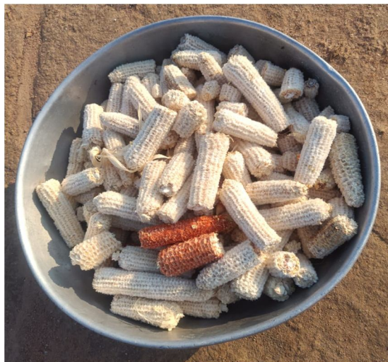
Corns-Cobs with desired moisture contain (INPUT SAMPLES)