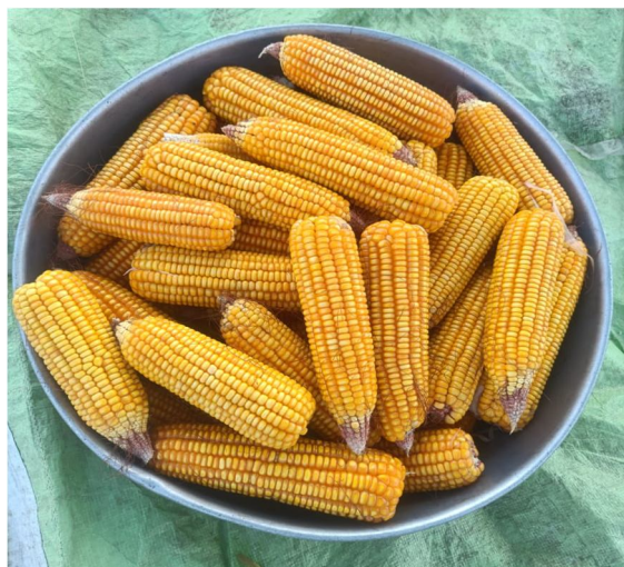
Corns with moisture

As a diluent, carrier, or filler in pharmaceuticals, agrochemicals, veterinary formulations, vitamin premixes, and other goods for the health of animals, among other uses. when used as a safe disposal method for liquid and solid effluents in environmental control. In horticulture, as a soil conditioner and water retention.