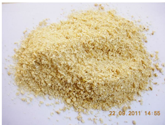
Pulverized sample (OUTPUT SAMPLE)