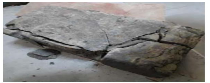
Fig: Brick after the compressive strength test, failure due to compressive load