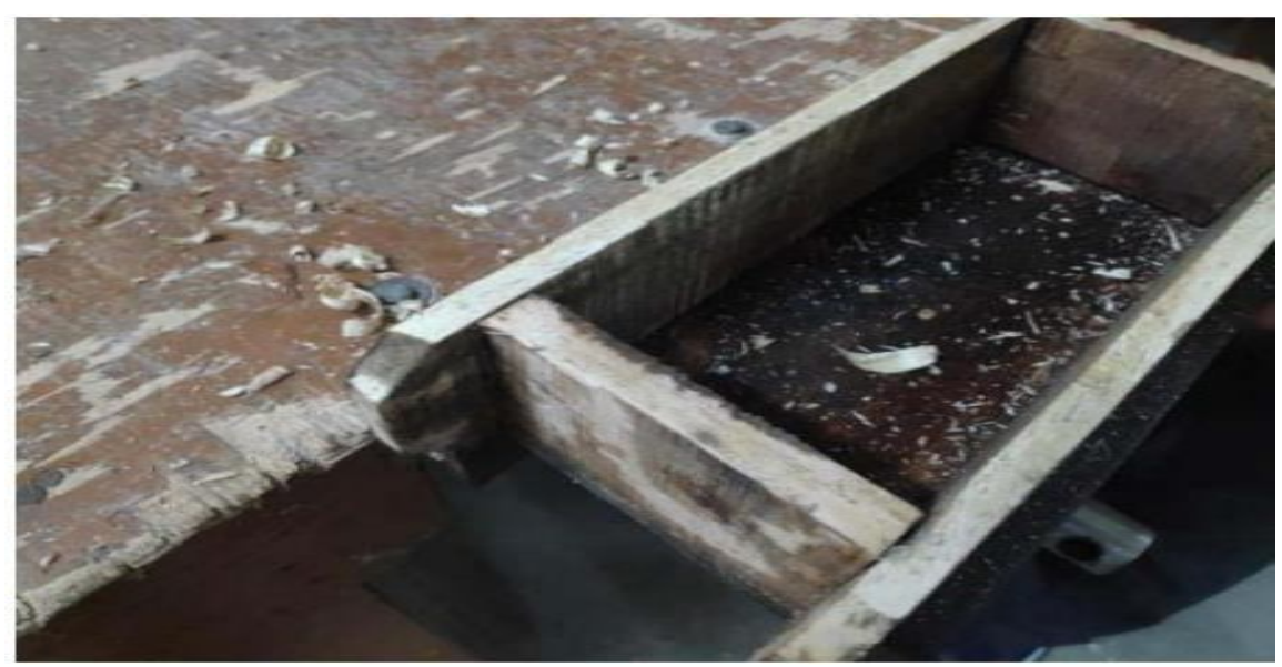
Fig: preparation in the carpentry shop

The moulds use dare wooden mould sand are made in the carpentry shop. All the side sand surfaces of the mould should be even for the brick to have better surface finish. Both fixed and movable mould scan be used for the purpose. Wooden mould will be cost effective and serve the purpose whereas if better surface finish is needed then cast-iron moulds can be used. Mould size would be (190*90*75)mm Mould.