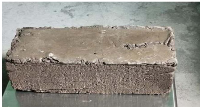
Fig: Plastic Sand Brick after removing it from the mould

In moulding process, the prepared mixture is then filled into wooden mould and then compressed by tamping rod. The pressure is applied by the tampering rod so as the mixture gets filled properly in the mould. Then it is left for cooling in air but before filling the mould apply oil on the walls of mould so that at last brick can be removed easily. The application of oil on the inner surfaces of the mould is must as after solidification the brick will not come out easily and to remove the mould some pressure must be applied that would wear the edges of the brick. So proper oiling is needed before filling the mixture in the mould. The brick then can be removed from mould after 24hours.