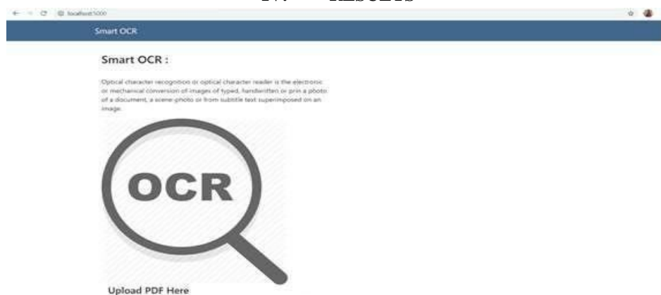
Fig. 2 Home Page