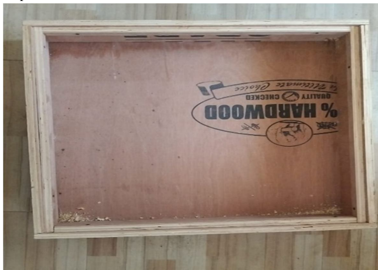
Fig4: Wooden side wall.