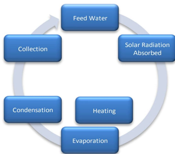
Fig1: Flow chart on process of Distillation

Looking ahead, the future of solar stills holds promise for further advancements and widespread adoption. As technology continues to evolve and economies of scale drive down costs, solar stills will become increasingly accessible to communities around the globe. Moreover, the integration of smart monitoring systems and remote sensing capabilities will enable real-time tracking of performance metrics and proactive maintenance, ensuring the long-term sustainability of solar still installations. By leveraging the power of innovation, collaboration, and community engagement, solar stills will continue to play a pivotal role in securing water resources for generations to come.