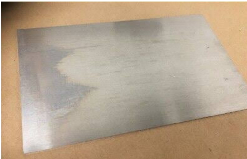
Fig3: Aluminum sheet

In general, solar stills are devices used to purify water by harnessing the heat from sunlight to evaporate water, leaving behind contaminants such as salts, minerals, and pollutants. The evaporated water then condenses on a surface (such as a tilted glass or plastic cover) and drips down into a collection basin as freshwater.