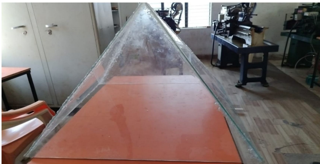
Fig5: Pyramid Glass Cover