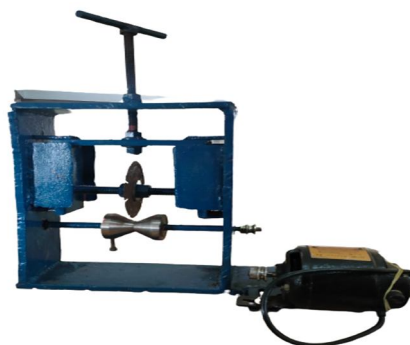
Fig. 6 Assembly of waste cable stripper machine