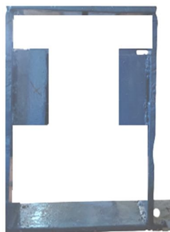
Fig. 5 Frame

Frame of the machine is in the form of rectangular shape. In order to arrest the vibration, structure is made up of cast iron material. Figure 5 realizes the structure of waste cable stripper machine.