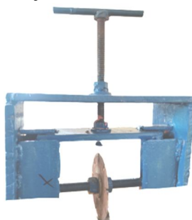
Fig. 4 Tool and adjuster

The rotary tool and adjuster adopted in waste cable stripper machine is presented in figure 4. Depending on the diameter the height of the rotary tool is adjusted for stripping with the help of adjuster.