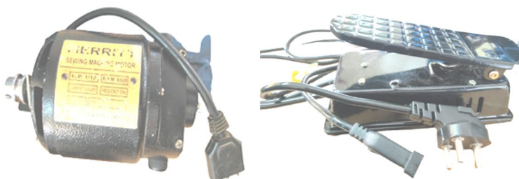
Fig. 2 Electrical motor and controller

The electrical motor was utilized as sewing machine motor for strip the waste cable with high torque. The motor is suitably controlled according to the required speed by foot step controller.