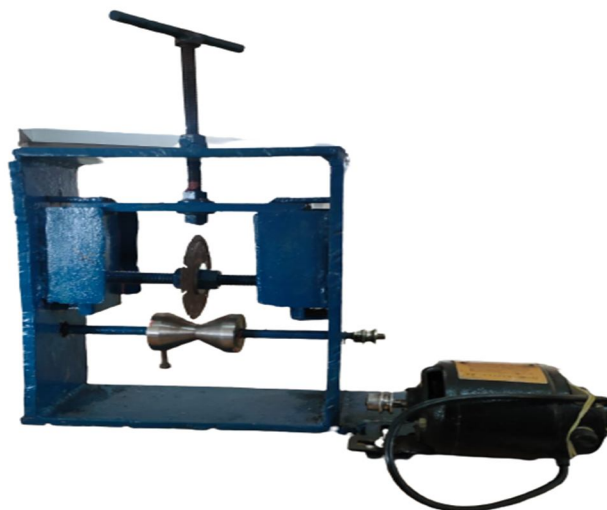
Fig. 1 Schematic diagram of waste cable stripper machine

The design of waste cable stripping machine was drawn using Schematic diagram. The waste cable stripper machine mainly consists of electrical motor, drive shaft, tool with adjuster and frame. The parts are fabricated as per the proposed design by field study. The manual metal arc welding process is enabled for joining all the parts rigidly. The parts of the waste cable stripper machine is detailed in the following sections 3.1-3.4.