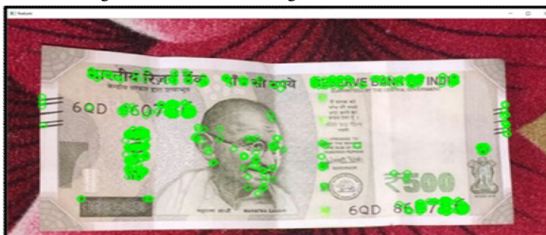
Figure 2: Snapshot of Feature extracted in Rs. 500 note.

As the features extracted are marked with green dots as shown in figure 2