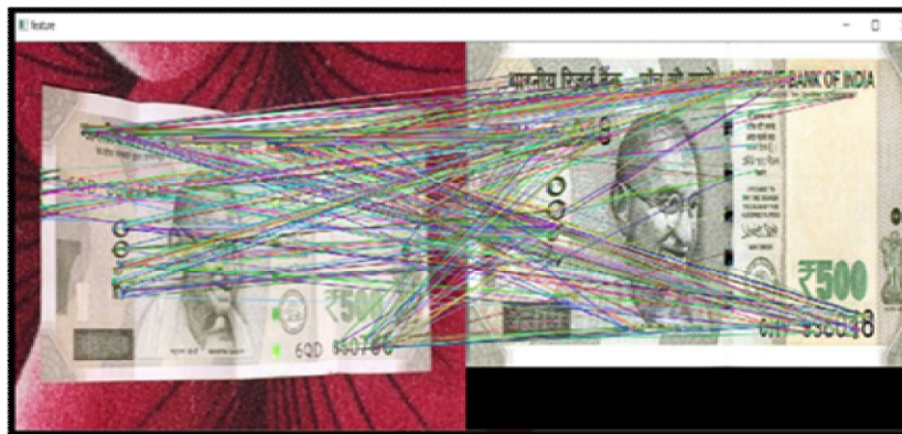
Figure 3: Snapshot of Feature Matching of Rs. 500 note.

All the features of input note that matches with the features in original note are highlighted with the coloured lines between the two notes as shown in figure 3.