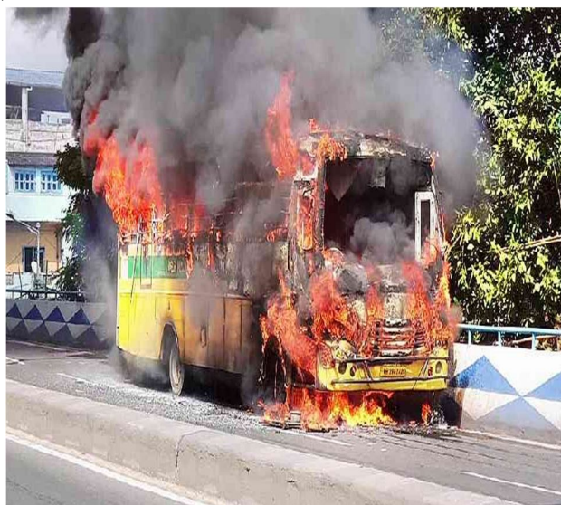
Fig: Busses caught fire and burning

At the same time the water and foam mixture is flowing through the steel pipes inside and outside and the sprinklers are already placed ,so the mixture will be sprayed by the sprinklers with some force.then the mixture will be spread to the entire bus. when ever a foam will be falls upon the fire can be resisted and the spreading of the fire will be decreased. Silicon foam is a synthetic rubber product used in gasketing, sheets are firestops .It is available in solid cured form as well as in individual liquid components for field installation.class B foams like AFFF,FP can also be used