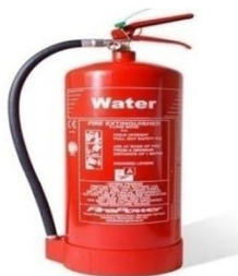
Fig. 2: Fire Extinguisher

It is used as a several methods to avoid fire accidents and to reduce the severity of loss in case of fire accidents in public transport system. The existing method consists of fire extinguishers, alarms, and when fire was detected humans must use fire extinguishers shown below in figure 2 and must break glass and must ring the alarm and break the glass of emergency door. And people must inform to police stations and fire stations and hospitals.