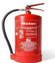
Fig. 2: Fire Extinguisher

It is used as a several methods to avoid fire accidents and to reduce the severity of loss in case of fire accidents in public transport system. The existing method consists of fire extinguishers, alarms, and when fire was detected humans must use fire extinguishers shown below in figure 2 and must break glass and must ring the alarm and break the glass of emergency door. And people must inform to police stations and fire stations and hospitals.