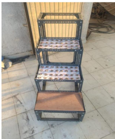
Figure 2: Arrangement of wooden plates over the sensors and movable springs

As indicated in figure 2, we modify the wooden plates above and below the sensors and adjustable springs to achieve this. Using your feet to generate non-conventional energy is as simple as transferring mechanical energy into electrical energy. The Footstep Board is made up of 16 piezoelectric sensors that are wired in series. When pressure is applied to the sensors, mechanical energy is converted into electrical energy. The 12v rechargeable battery linked to the inverter will store this electrical energy. The battery charging system employed here is a standard battery charging device that is widely used in other applications. This inverter converts 12 volts D.C to 230 volts A.C to provide power to the circuits. This 230 Volt A.C voltage is utilized to activate the loads, and we may run AC loads with this voltage.