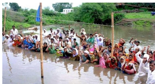
Figure 2 Policy critic-Sardar Sarovar

The implementation of the Sardar Sarovar Dam Project involved the construction of a massive concrete dam, known as the Sardar Sarovar Dam, across the Narmada River in the western Indian state of Gujarat. The dam, with a height of approximately 163 meters (535 feet), created a reservoir called the Sardar Sarovar Reservoir or Lake, which spans a vast area. The project also involved the construction of canals, pipelines, and infrastructure to facilitate the distribution of water for irrigation, power generation, and domestic consumption.