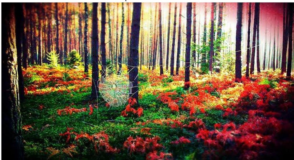
Fig 1 showing the Better Forest Management System

Scientists have estimated that India should ideally have thirty three percent of its total land under forest covers. But the estimation and necessity still far from its exceeding. The thing which is of main concern is not only to protect existing forests but also to increase our forest cover almost three times of its current presence.