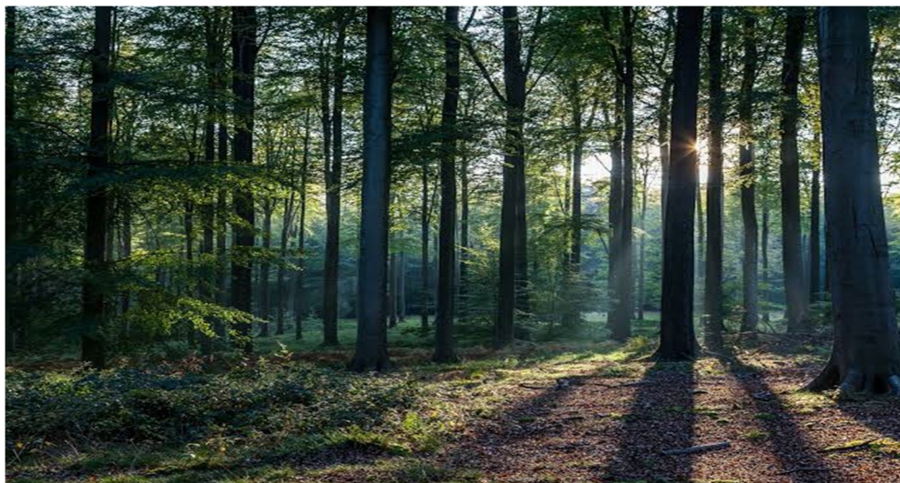
Fig 2 showing the Trees Talk to Each other and Recognize their Offspring

People have the tendency to adapt to the conditions wherever the scenic great thing about our surroundings have associate degree depiction of natural beauty that it actually inherits. One in all the prime examples is that the attributes of the forest. Mostly over the years they need been bit by bit identified and meant to be changed by humans. Normal depiction within somebody's scientific discipline is village, however ever since our food supplements and trade merchandise are commercialized, the focus has drifted towards cities and fashionably developed metropolitan cities.