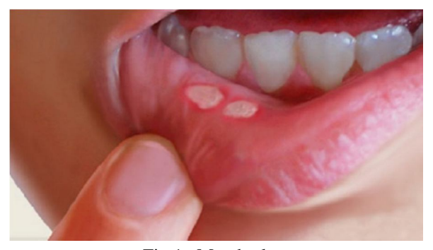
Fig 1. Mouth ulcer

ISSN: 2321-9653; IC Value: 45.98; SJ Impact Factor: 7.538 Volume 12 Issue VI June 2024- Available at www.ijraset.com