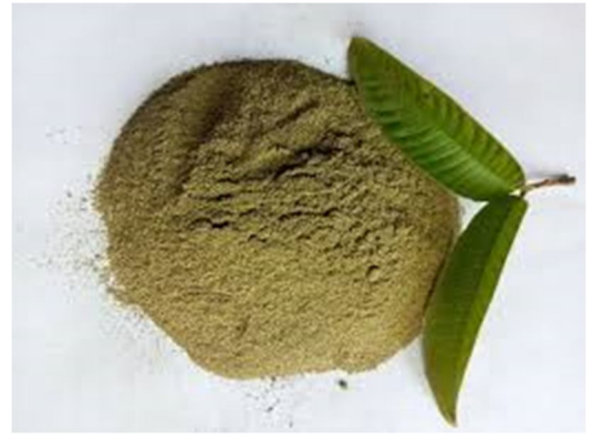
Fig 4 .Guava leaves Powder

All chemicals used for different experimental studies such as chloroform, conc.H2SO4, ammonium hydroxide, methanol, formic acid, acetonitrile, ampicillin, glucose, phenol red, 5,5- dimethyl pyrroline- N-oxide (DMPO), FeSO4, H2O2 were of analytical grade procured from M/s. SDFine, M/s. Qualigens and M/s. SRL, India. Pectin was procured from Purix India Pvt. Ltd., 2,2- diphenyl- 1-picrylhydrazyl (DPPH).