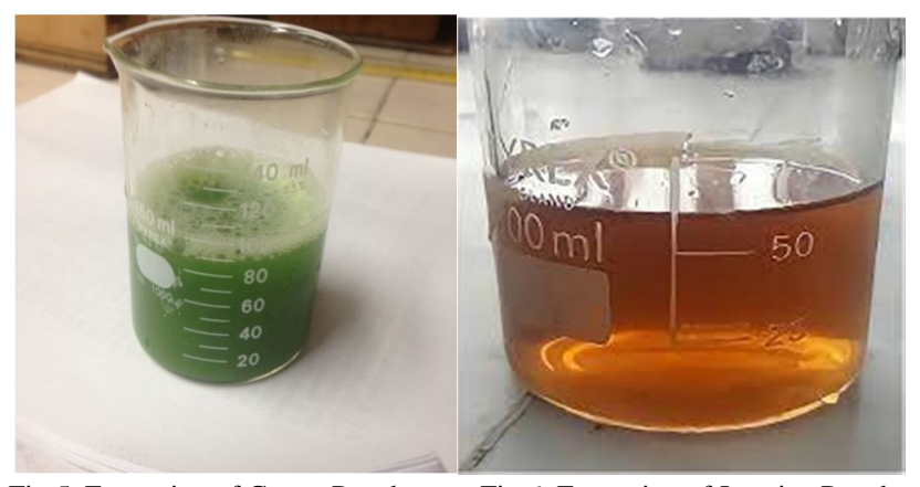
Fig 5. Extraction of Guava Powder

The leaves of guava and Jasmine were washed under running tap water to remove dust particle and shade dried at room temperature for 3-4 weeks. The dried plant parts were reduced to coarse powder with a mechanical grinder and passed through #40 mesh sieve. The Powered was then subjected to extraction by cold maceration using water, methanol and ethanol to attain their respective extract. Both 15 gm of dried guava and jasmine powdered were macerated in 62 ml of ethanol and water and separate conical flask for 24 hours at room temperature, under occasional shaking. After 24 hours mixture was filtered out using simple filtration method and filtrates were collected in separatevessels. To obtain the extract the solvent was removed from the filtrate under reduced pressure by using a rotary vacuum evaporator at 45-50°C.