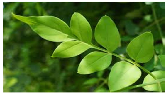
Fig 3.Jasmine leaves

Another name for Jasminum Officinale is Chameli, Jai. The Medicinal Plant of the Oleaceae Family. The ovate leaves are 4–12.5 cm in length and 2–7.5 cm in width. Jasmine Officinale has astringent, stimulant, sedative, stomachic, anti-oxidant, and anti-inflammatory properties. Alkaloids, tannins, terpenoids, glycosides, steroids, essential oil, and saponin are all contained in it. Jasmine is used to treat skin conditions and wound healing.