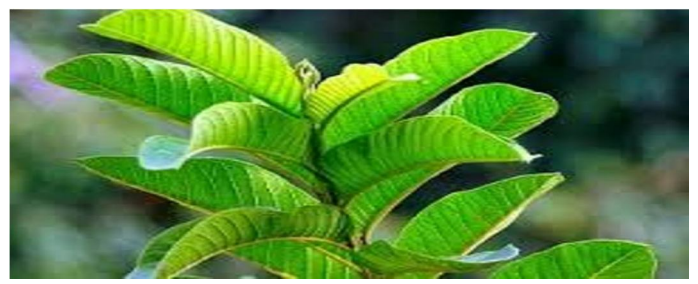
Fig 2. Guava leaves

Volume 12 Issue VI June 2024- Available at www.ijraset.com