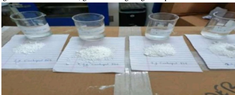
Fig. 2.1 base formulation of hair gel

The gels formed using 0.5gcarbopol 934 were found to be very thin that liquefied within 4 to 5 hours of preparation. The gel formed using 1g carbopol 934 gel formation was better tosomeextent but the problem of liquefaction after 24 hours was observed. The gel formulation containing 1.5g of carbopol 934 formed uniform and smooth gel that did not liquefy even after 24 hrs. With 2gcarbopol 934 the gel formation was better to some extent but problem was too thick tohandled. Whereas gel containing 2.5g carbopol 934 was too thick to be handled.Among the Five formulations, gel containing 1.5g carbopol 934.