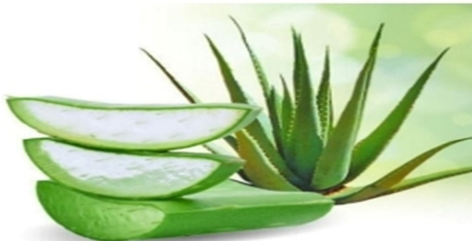
Figure 2: Aloe vera

. Chemical components include: More than 75 distinct substances have been found in aloe vera, including vitamins (A, C, E, and B12), minerals (zinc, copper, selenium, and calcium), enzymes (catalase, amylase, and peroxidase), and sugars (monosaccharides like mannose-6-phosphate and polysaccharides such as glucomannans), anthraquinone.