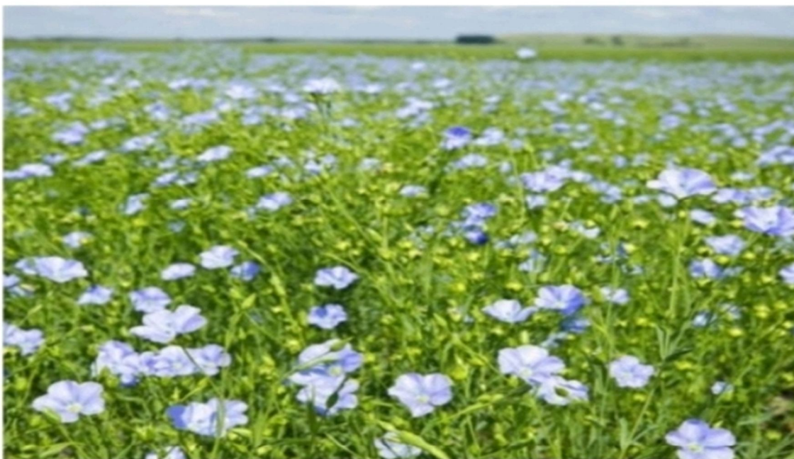
• Flowers of flaxseed