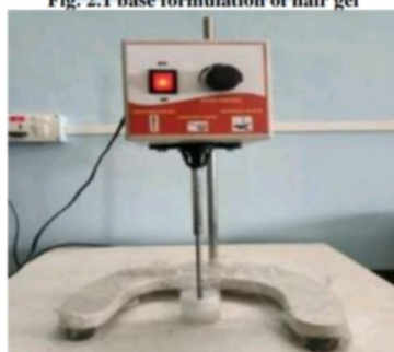
Fig. 2.2 Mechanical Stirrer