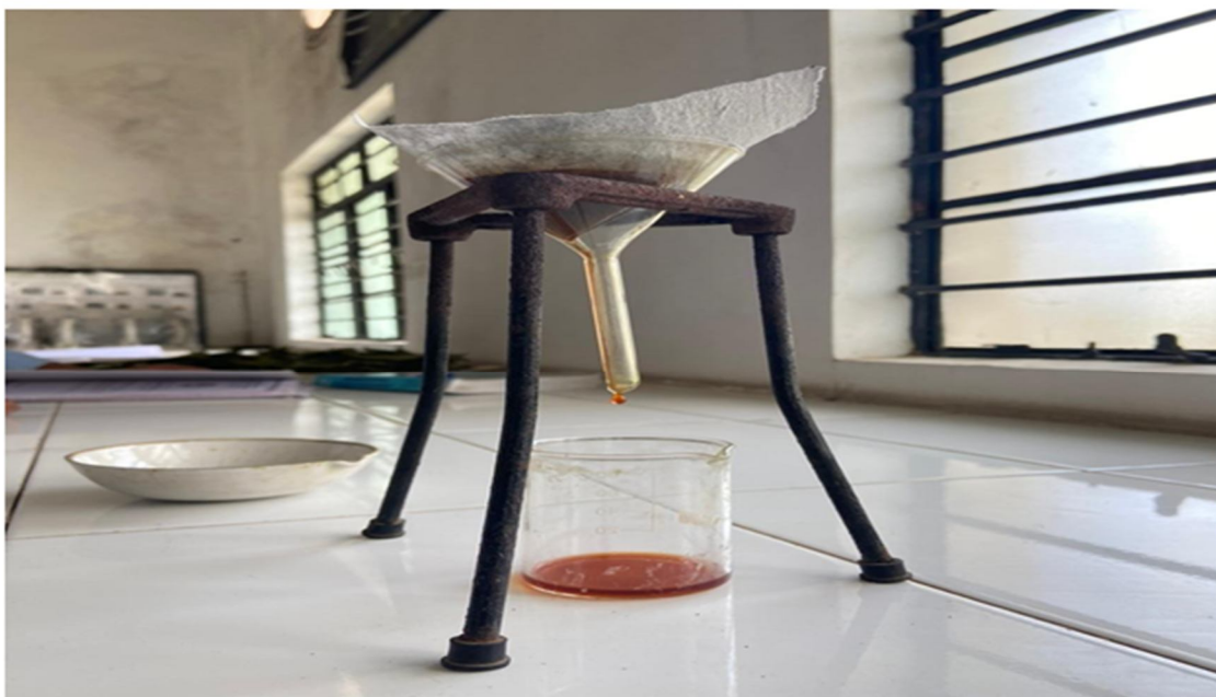
Fig No.9: Filtration Process

Filtration of extract was done by using simple filter paper and funnel for 2 times 31 .