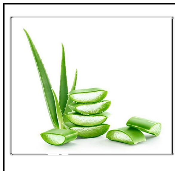
Fig.No.2: Aloe Vera