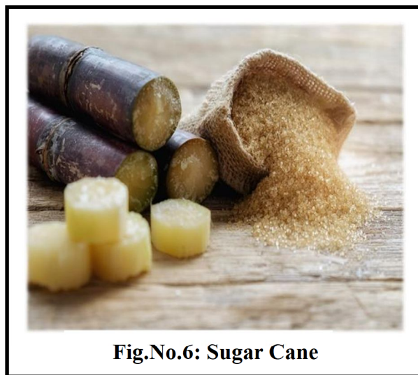
Fig.No.6: Sugar Cane