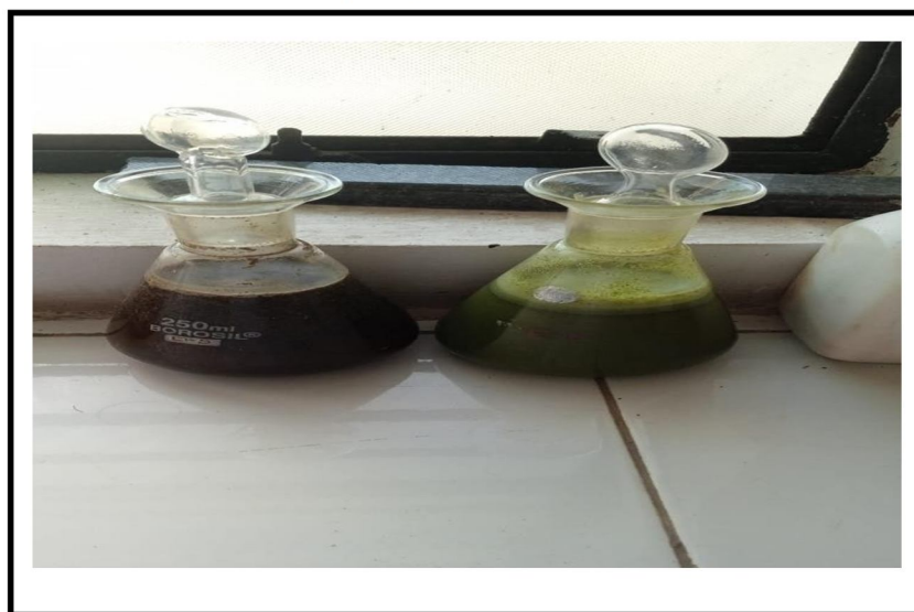
Fig No.7: Tulsi And Neem Extract

Turmeric extract was prepared by using soxhlet apparatus. Extraction was dried and stored in a desiccator for further use.