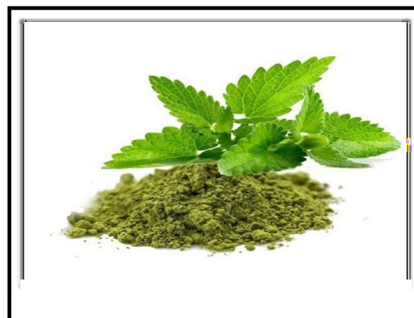
Fig.No.2: Tulsi Leaves Powder