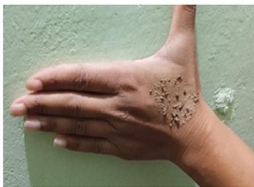
Fig. No.10: Day1