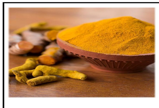
Fig.No.2: Turmeric Powder