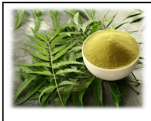
Fig.No.1: Neem Leaves Powder