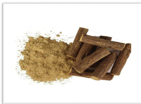
Fig 6: Liquorice

Synonyms: Glycyrrhiza, glycyrrhiza radix, mulethi.