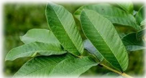
Fig 1: Guava Leaves

Botanical description: The root system of Psidium guajava is typically superficial and very extensive, frequently extending well beyond the canopy. There are some deep roots, but there is no clear taproot. [2]