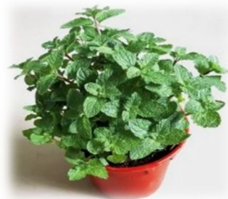
Fig 2: Peppermint Oil [3]

Synonyms: Oleum mentha piperita , Colpermin, Mentha oil.