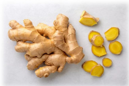
Fig 3: Ginger Plant

Ginger consists of whole or cut, dried scrapped or unscrapped rhizomes of Zingiber officinale Roscoe , family Zingiberaceae . It contains not less than 0.8% of total gingerols on a dried basis.