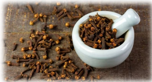
Fig 4: Clove

Biological Source: Clove consists of dried flower buds of Eugenia caryophyllus , family Myrtaceae . It should contain not less than 15% (v/w) of clove oil.