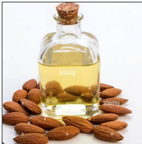
Fig 10 : Almond oil