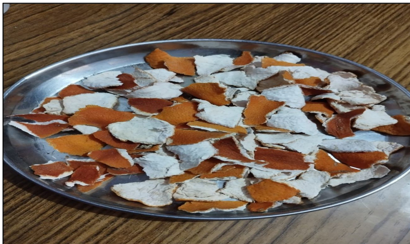
Fig 4: peels of citrus sinensis

New natural product of citrus sinensis was collected. peels were altogether wash in distilled water and dried legitimately in shed. The dried peels were finely pounded utilizing electrical processor and put away in a discuss tight holder for advance use