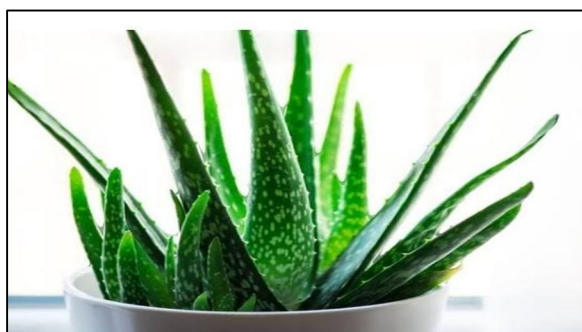
Fig 9:Aloe vera

Botanical call- Aloe berbendis Family- Liliaceae