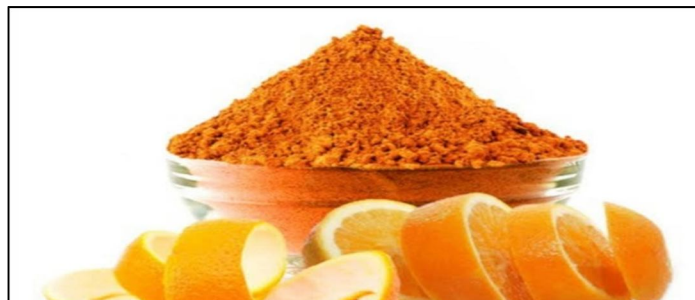
Fig 5: Orange powder

Orange powder has citric corrosive. It naturally helps and brighten the pores and skin. With standard utilize of orange peel powder, it is able to arrange of tan. It may be utilized in ceasing revolting pores and skin breakout. pectin is the biopolymer gotten from orange peel that's utilized in suppers in expansion to pharmaceutical industry. Cancer prevention agents too are found in orange peel and it furthermore help in hydrating imbecilic and got dried out pores and skin.