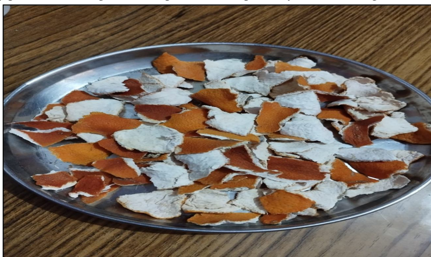
Fig 4: peels of citrus sinensis

New natural product of citrus sinensis was collected. peels were altogether wash in distilled water and dried legitimately in shed. The dried peels were finely pounded utilizing electrical processor and put away in a discuss tight holder for advance use