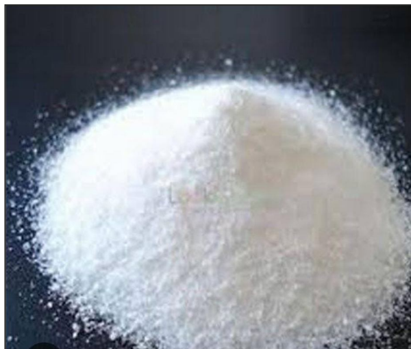
Fig 11 :Methylparaben

Methylparaben as being a moo to direct wellbeing risk. Be that as it may, the danger is as it were in respects to unfavorably susceptible responses or item usageMethylparaben could be a 4-hydroxybenzoate ester coming about from the formal condensation of the carboxy bunch of 4-hydroxybenzoic corrosive with methanol. It is the foremost regularly utilized antimicrobial