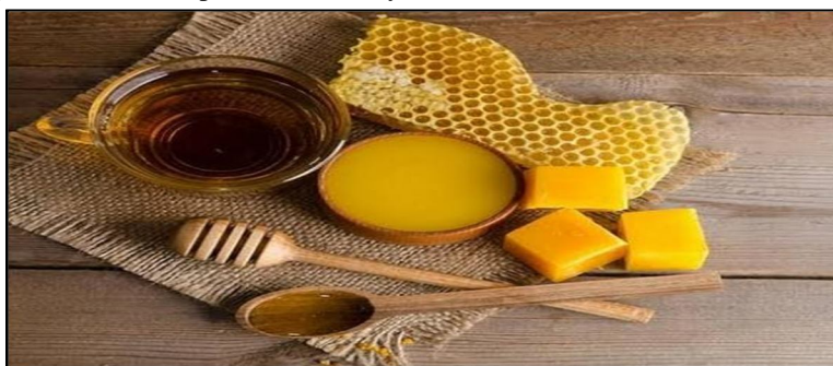
Fig6: Bees wax