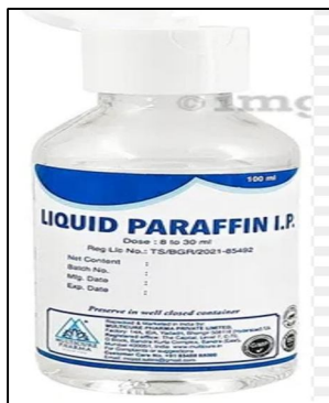
Fig8: Liquid paraffin

Aloe vera may be utilized in different ways. The clears out are gray to unpracticed in color and styles of those plants' white bits at the beat and diminish stem floor. In later times aloe vera is utilized in dermatology for assorted reason. The most extreme work of aloe vera on this cream is moisturization