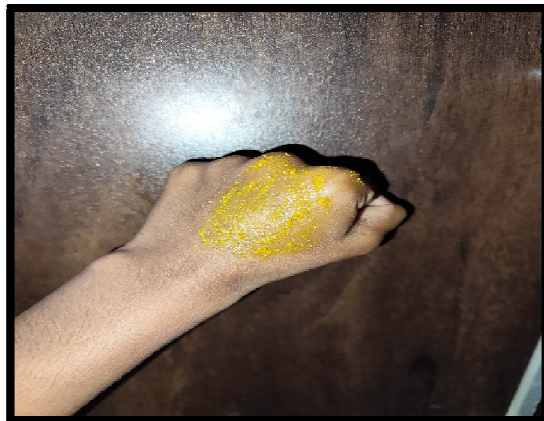
Fig no.18 :-Spreadability and skin irritation