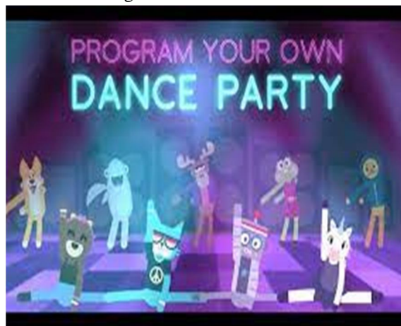
Figure 1 : Dance & Computing

Along with the progress of society and the huge development in the field of science & technology, computing technologies have been widely used to the life of people, in the development of modern technologies of teaching and practices. Quality education is in demand nowadays and teaching of dance is also being taken seriously now. Fusion of dance and computing put forward a new challenge, make originally relatively interactive teaching between teacher and students in this technical era of computer science.