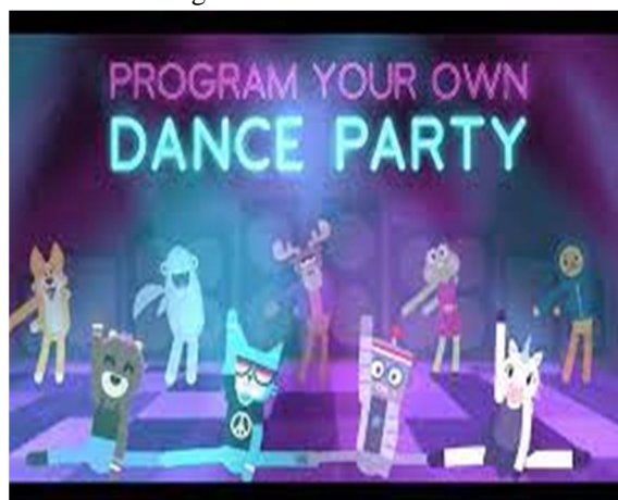
Figure 1 : Dance & Computing

Along with the progress of society and the huge development in the field of science & technology, computing technologies have been widely used to the life of people, in the development of modern technologies of teaching and practices. Quality education is in demand nowadays and teaching of dance is also being taken seriously now. Fusion of dance and computing put forward a new challenge, make originally relatively interactive teaching between teacher and students in this technical era of computer science.