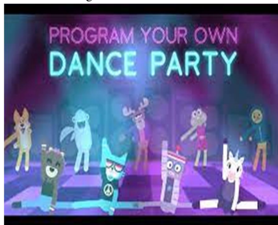
Figure 1 : Dance & Computing

Along with the progress of society and the huge development in the field of science & technology, computing technologies have been widely used to the life of people, in the development of modern technologies of teaching and practices. Quality education is in demand nowadays and teaching of dance is also being taken seriously now. Fusion of dance and computing put forward a new challenge, make originally relatively interactive teaching between teacher and students in this technical era of computer science.