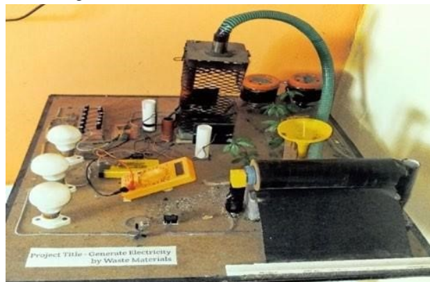
Fig. 3. Prototype

The batteries relate to the heat sensor and LED bulbs. Whenever the heat sensor will start conducting the batteries allow energy to flow will start conducting and LED bulbs will glow.