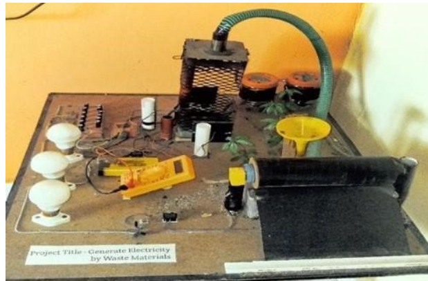
Fig. 3. Prototype

The batteries relate to the heat sensor and LED bulbs. Whenever the heat sensor will start conducting the batteries allow energy to flow will start conducting and LED bulbs will glow.