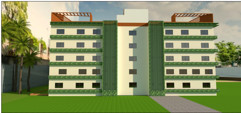
Fig 3. 3D Side view