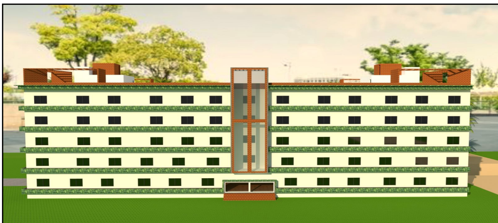
Fig 2. 3D Front View