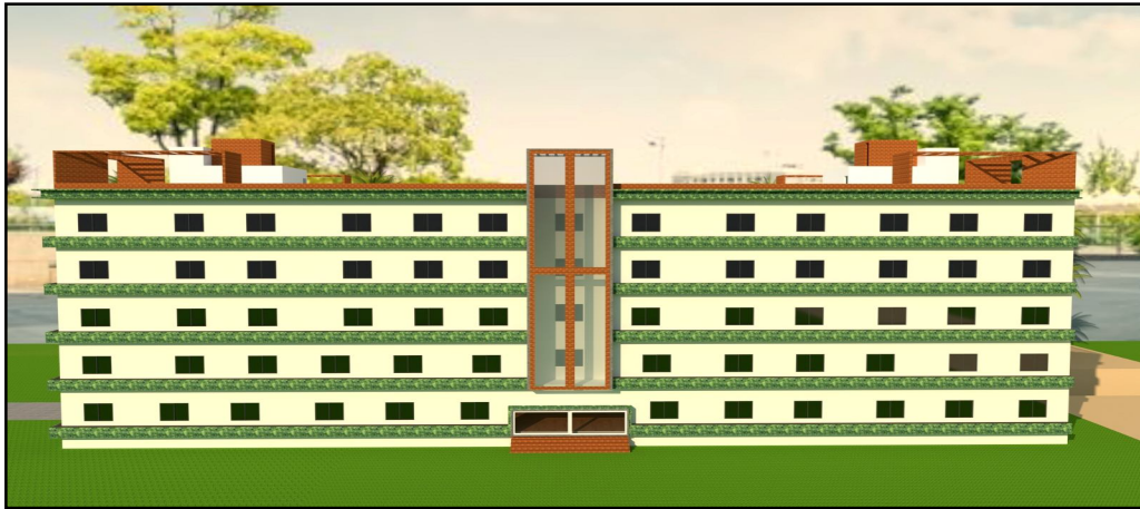
Fig 2. 3D Front View