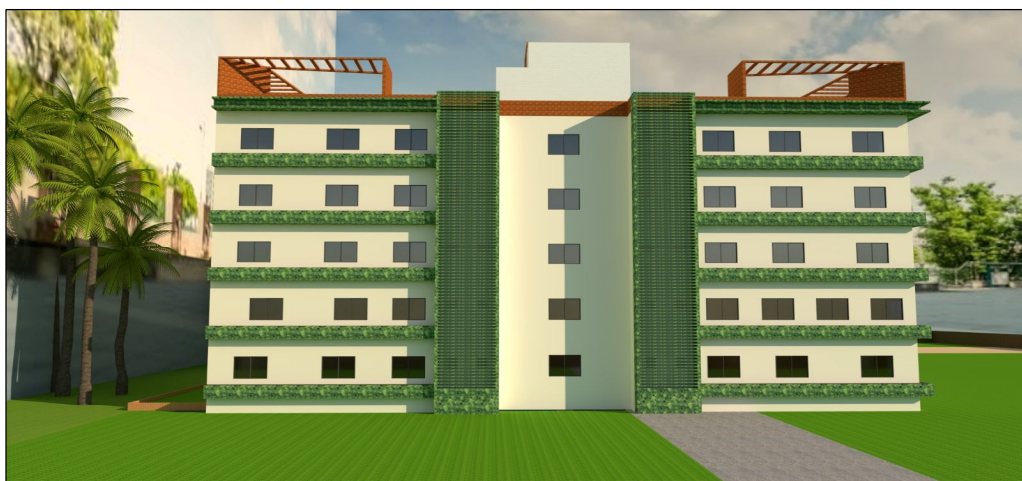
Fig 3. 3D Side view