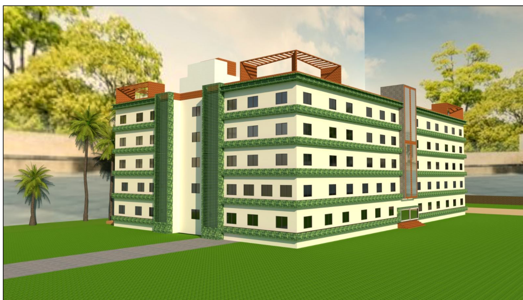
Fig 4. 3D view