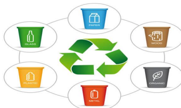
Fig 1. Waste Types