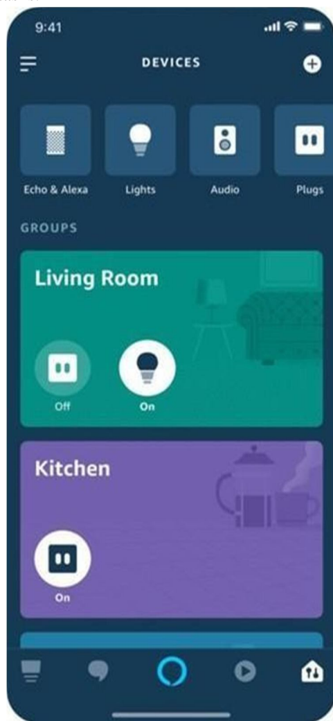
Fig.3 Alexa Home Screen

Amazon Alexa, also known simply as Alexa, is a virtual assistant technology largely based on a Polish speech synthesizer named Ivana, bought by Amazon in 2013. It was first used in the Amazon Echo smart speaker and the Echo Dot, Echo Studio, and Amazon Tap speakers developed by Amazon Lab126. It is capable of voice interaction, music playback, making to-do lists, setting alarms, streaming podcasts, playing audiobooks, and providing weather, traffic, sports, and other real-time information, such as news. Alexa can also control several smart devices using itself as a home automation system. Users are able to extend the Alexa capabilities by installing "skills" (additional functionality developed by third-party vendors, in other settings more commonly called apps) such as weather programs and audio features. It uses automatic speech recognition, natural language processing, and other forms of weak AI to perform these tasks.