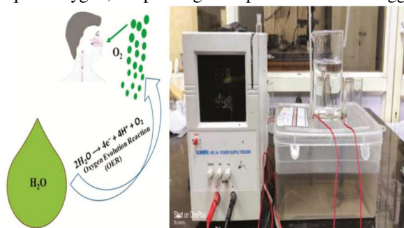
Fig. 6.1: Oxygen evolution reaction setup

Through a chemical reaction, oxygen is produced in this process; the oxygen source is frequently an inorganic compound like superoxide, chlorate, or perchlorate. The chemical reaction in this oxygen generator is typically exothermic, and a firing pin is used to start the process. In order to provide passengers with emergency oxygen, commercial aeroplanes often use chemical oxygen generators. The oxygen canisters and masks are fastened to the aircraft's top. The panels automatically open and the masks are taken off if there is any decompression. To acquire oxygen, the passengers depress the mask's trigger and draw down the mask.