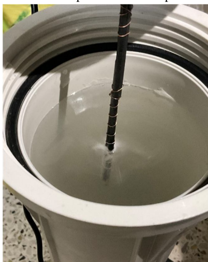
Fig.5.2: Oxygen generated at anode

Hence, more than twice as many hydrogen molecules as oxygen molecules are created. The volume of the hydrogen gas is twice that of the oxygen gas since both gases are produced at the same pressure and temperature.