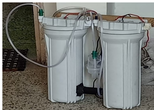
Fig. 7.1: Water electrolyzing cell

Two electrodes are present in the electrolyzer, and each electrode is wired to a power source. When an electrical current produced by the power source or the pulse generator is passed between two electrodes, water is split into hydrogen and oxygen. while they are submerged in water.