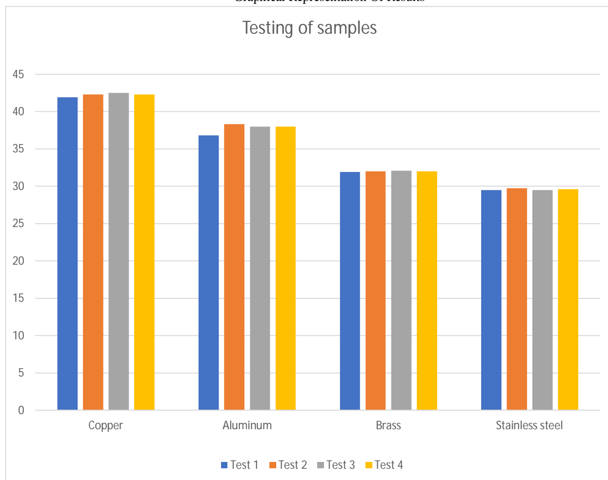
Graphical Representation Of Results

Since this is new concept still in research and not yet developed. The main reason to develop this device is to identify the type of metal which in welding section , research of material and metal. To inbuilt the values of different metal's Heat transfer rate is tested and values are inserted in the program coding as the range within 20 seconds. Through this 20 seconds gap the heat transfer from one end of the metal piece to another end. Temperature sensor(110w) thermistor is used in sensing of the heat transferred from the T1 and final temperature is considered as T2. This device is built in low cost and efficient manner. Arduino plays important role in this device which helps in identifying the material automatically. Where Arduino MAX6675 is the model used in this device to make the program to run in enhanced transmission speed.