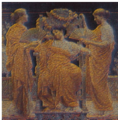
Prompt: "A painting made with multi-colored airport carpet fabric"

To address this issue, we present a parametric texture model in this paper. Instead of using a model for the early visual system to describe textures, we employ a convolutional neural network as the foundation for our texture model, which is a functional model for the entire ventral stream. As a result, we have a texture model that is parameterized by spatially invariant representations based on the convolutional neural network's hierarchical processing architecture.