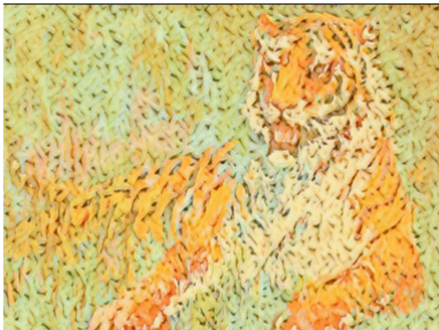
Style Transfer Example: Style Image: A picture of cooked pasta

To create a new texture based on a white noise image, we use gradient descent to find another image that fits the Gram-matrix representation of the original image. In this optimization, the mean-squared distance between the entries of the original picture's Gram matrix of the image being generated is minimized.