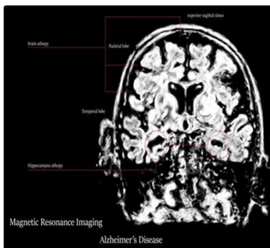
Fig2.Region of Interest

Determine the ROI for the MRI. AD is detected by looking for atrophy in the hippocampus, brain, and parietal lobe. Fig 2. In the Brain MRI, highlight the region of interest.