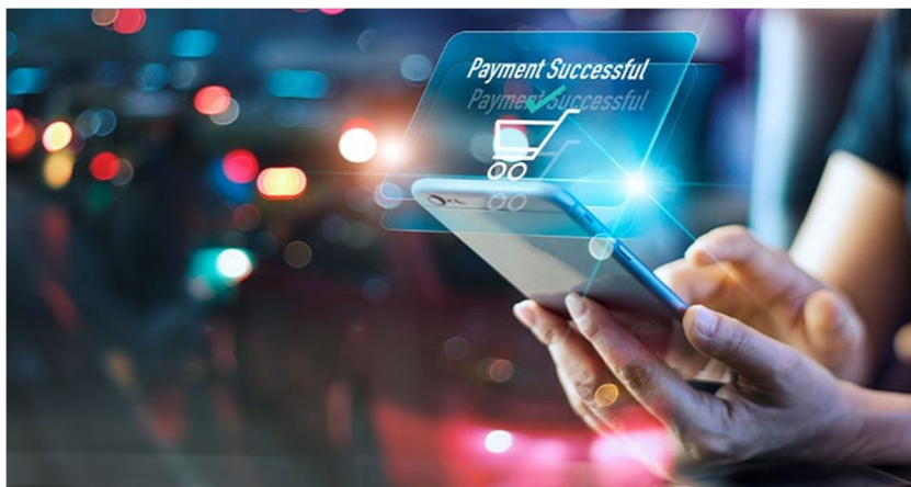
Figure 1: E-banking (Eelectribuc Banking)

Electronic banking, or e-banking, is the digital distribution of financial services by banks and other financial organizations via electronic means. It includes a wide range of services, such as mobile and internet banking as well as automated teller machines (ATMs), which let clients carry out different financial operations from a distance. Consumers may conveniently and easily handle their accounts, transfer money, pay bills, apply for loans, and get financial information using e-banking services. Technology breakthroughs, like the internet, mobile devices, and safe encryption methods, have made e-banking more widely used and changed the conventional banking environment. This move to digital banking has improved speed, efficiency, and openness in banking processes in addition to increasing access to financial services. By reaching underprivileged groups and isolated places, e-banking has also made financial inclusion easier and enabled people and companies to engage more fully in the economy. In general, e-banking is a significant development in the banking industry that has brought in a new period of creativity, accessibility, and connection in financial services.