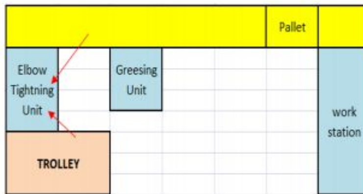
Figure 2. Improvement in station layout after MOST