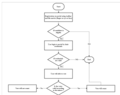
Fig. 1. Application flow diagram

Below diagram depicts the whole system architecture.