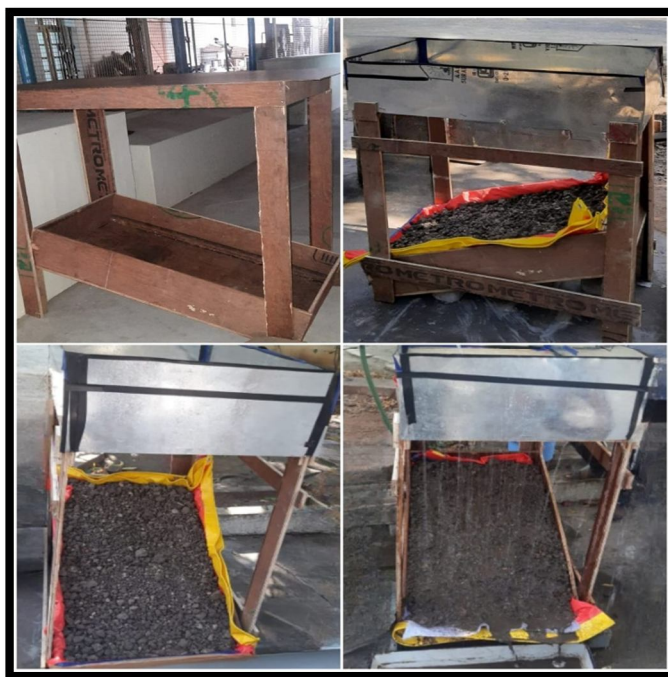
Figure 1: Experimental Setup and Artificial Rainfall in Slope Model

The erosion tests were conducted using a rainfall simulator which is a tank of size 1m x 0.5m x 0.2m. The discharge required for different intensities are calculated. Based on the discharge, the size of the water tank was selected with 2mm diameter holes and 5cm spacing between the holes. The bottom of the tank is drilled with a total of 180 holes. Through these holes, water is allowed to pass through which is intended to obtain the desired rainfall intensities 60mm/hr and 70mm/hr. The rainfall intensity is simulated by maintaining the calculated head of water in the tank for an hour. The intensity is obtained by filling water tank up to a certain height. The rate of soil erosion was calculated for different intensities. The experimental setup is shown in figure 1.