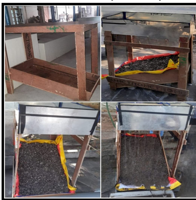
Figure 1: Experimental Setup and Artificial Rainfall in Slope Model

The erosion tests were conducted using a rainfall simulator which is a tank of size 1m x 0.5m x 0.2m. The discharge required for different intensities are calculated. Based on the discharge, the size of the water tank was selected with 2mm diameter holes and 5cm spacing between the holes. The bottom of the tank is drilled with a total of 180 holes. Through these holes, water is allowed to pass through which is intended to obtain the desired rainfall intensities 60mm/hr and 70mm/hr. The rainfall intensity is simulated by maintaining the calculated head of water in the tank for an hour. The intensity is obtained by filling water tank up to a certain height. The rate of soil erosion was calculated for different intensities. The experimental setup is shown in figure 1.