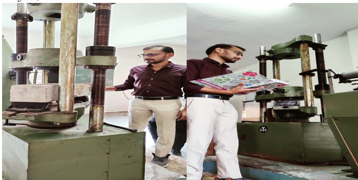
Figure1. Flexural Strength of beam

d = average thickness, measured from both ends of the fracture line, in mm. The maximum load P shall be reported as-the breaking load, nearest to 1 N.