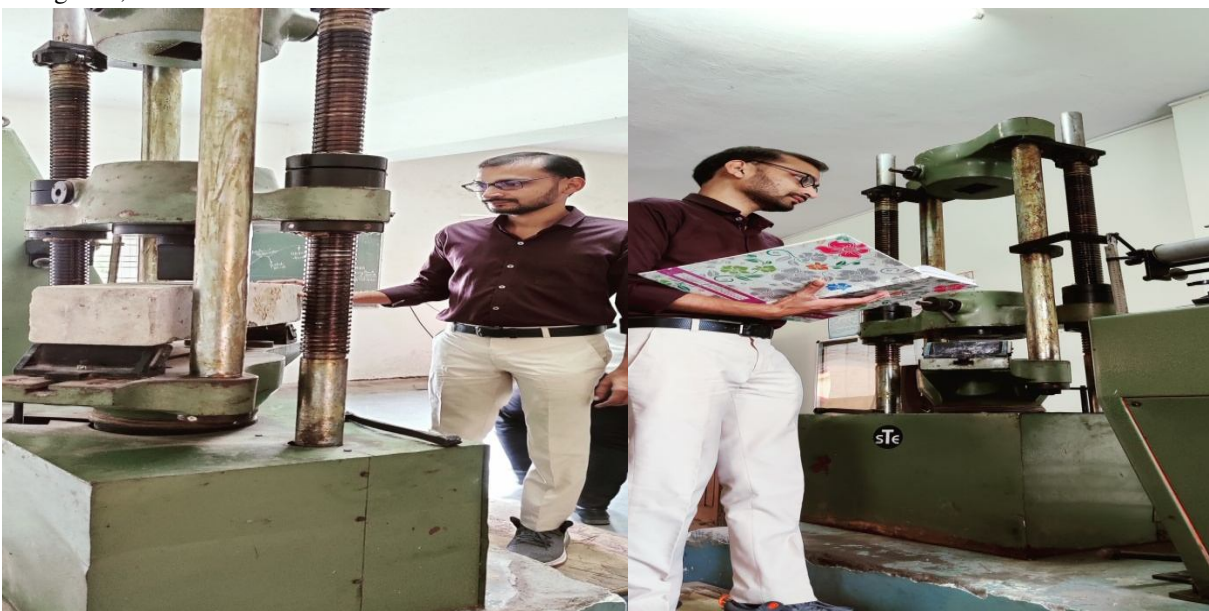
Figure1. Flexural Strength of beam

d = average thickness, measured from both ends of the fracture line, in mm. The maximum load P shall be reported as-the breaking load, nearest to 1 N.