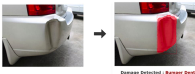
Figure1. Car damage detection

One of the more interesting applications of computer vision is identifying pixels in a picture and using them for diverse and remarkably useful purposes.